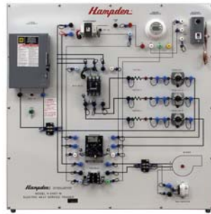
H-EHST-1B Electric Heat Service Trainer

Dimensions: 36"H x 36"W x 13"D. Shipping weight: 260 lbs.