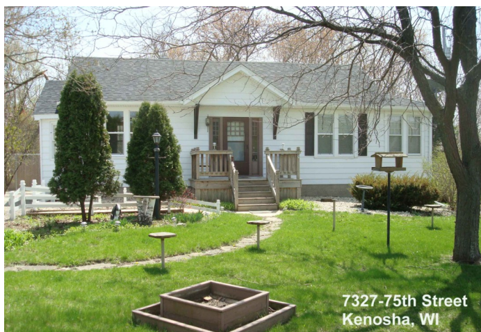
7327-75th Street Kenosha, WI

The club's next-door rental property is available.