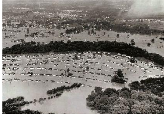
Picture of flooded Crestwood in 1949