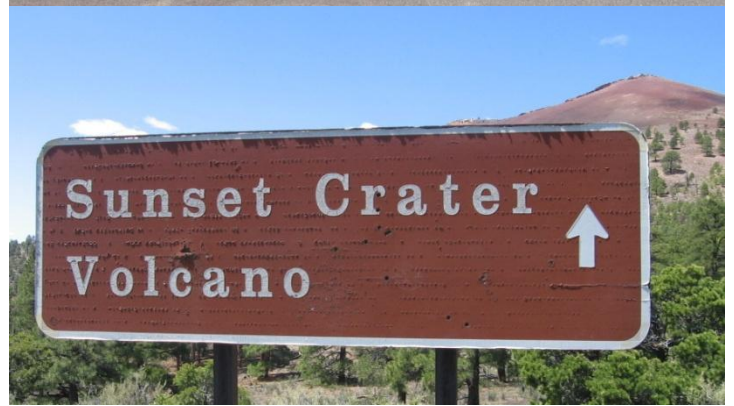
For those not old enough to remember, Sunset Crater first erupted in 1064 AD