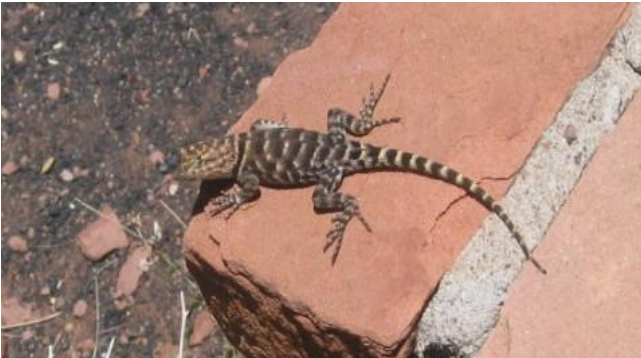
One of the locals came out to greet us