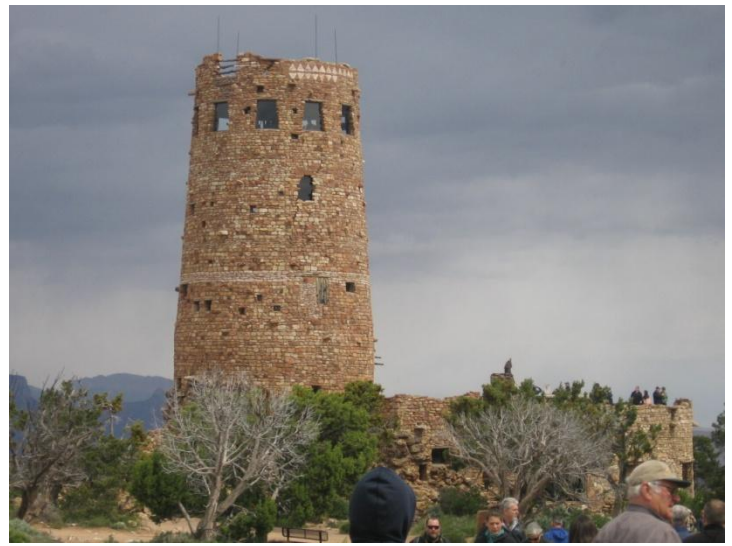
Tower at Grand Canyon