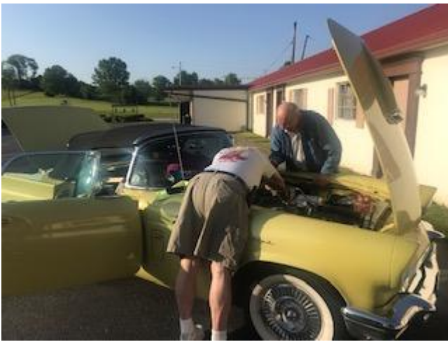
Bye Bye Fuel Injection