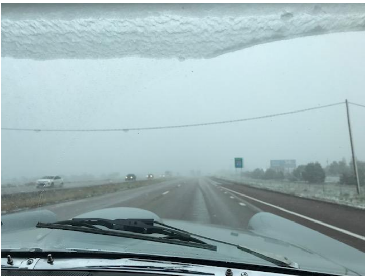
Yes - that is SNOW