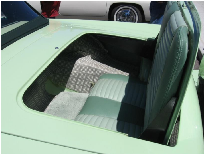
"Bird's Nest" aftermarket accessory