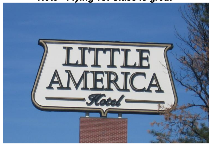
NJTA TBird Show