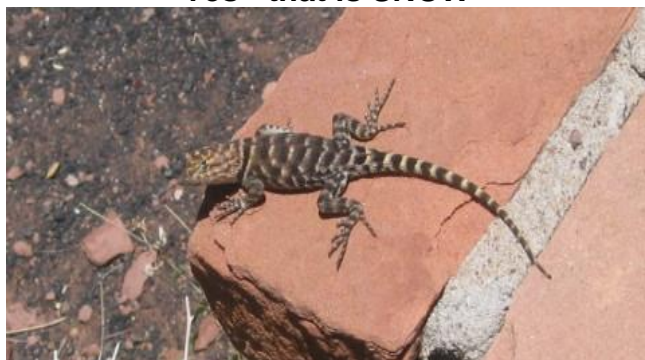
One of the locals came out to greet us