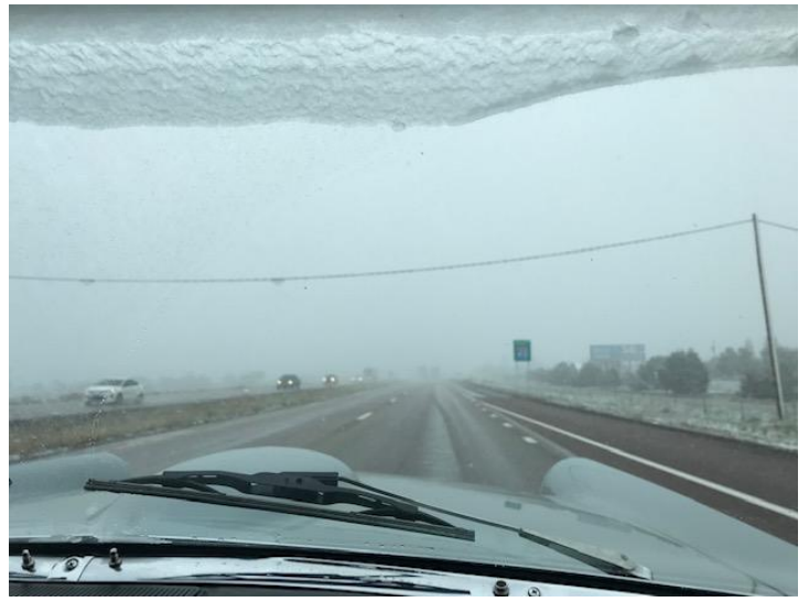
Yes - that is SNOW