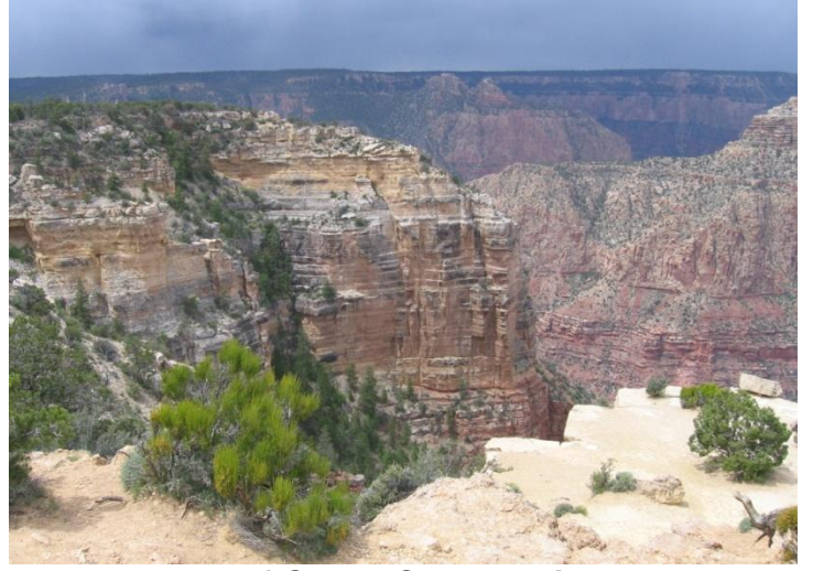
I took a lot of Crand Canyon pictures, but pictures don't it it justice