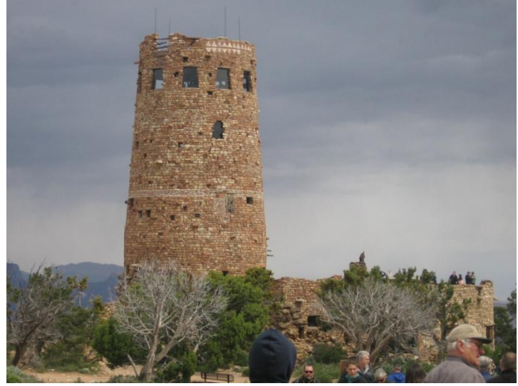
Tower at Grand Canyon