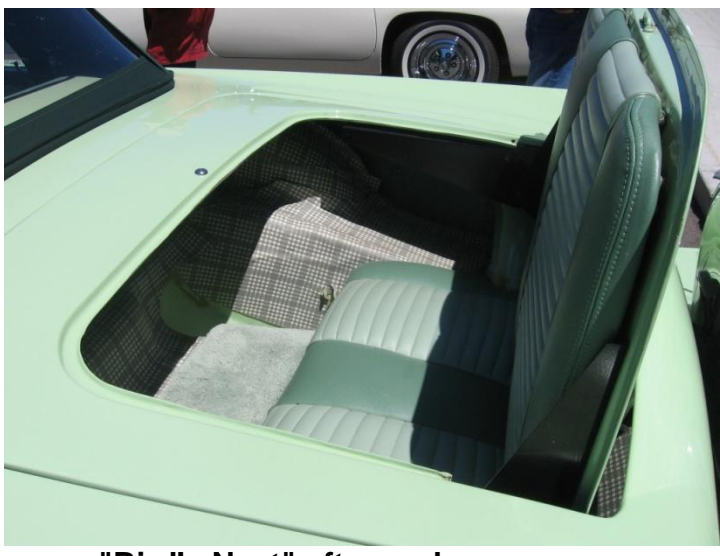
"Bird's Nest" aftermark accessory