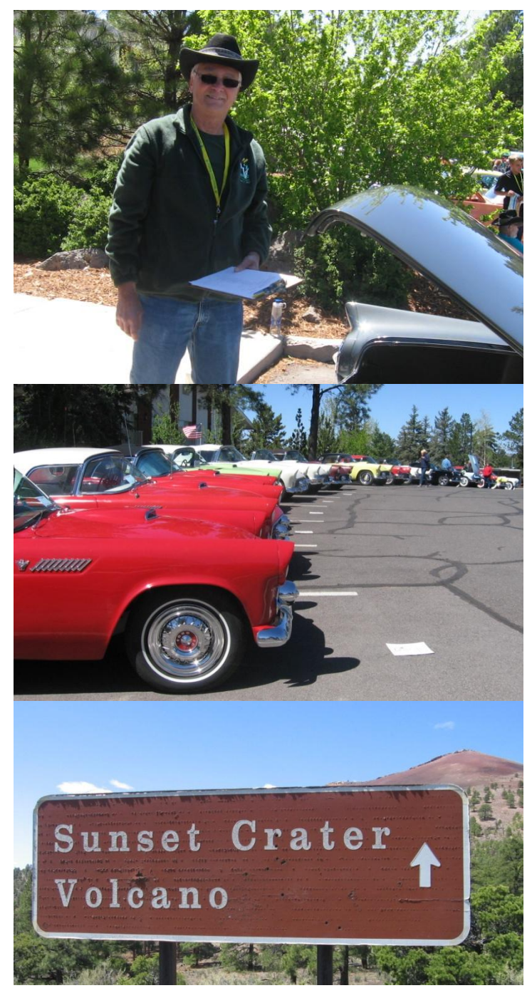
For those not old enough to remember, Sunset Crater first erupted in 1064 AD