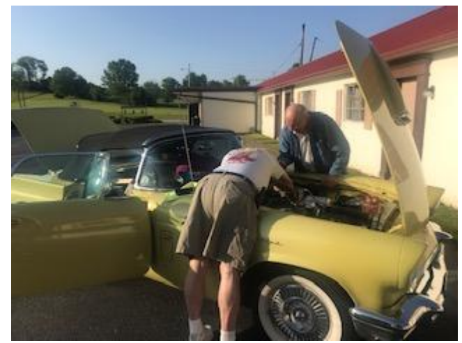
Bye Bye Fuel Injection