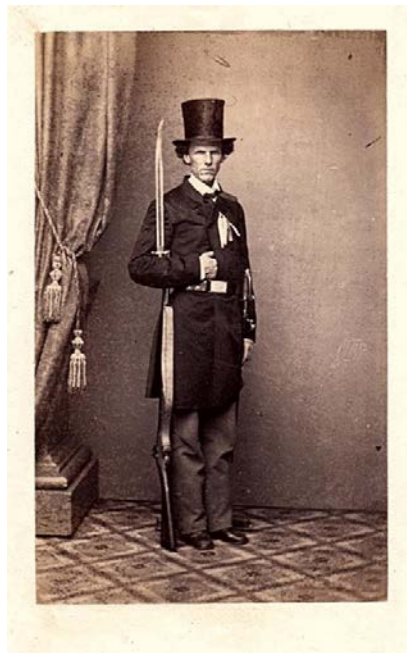
James Henry Lane (1814-1866)