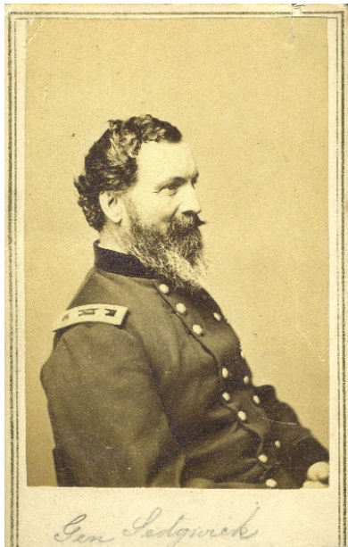
John Sedgwick (1813-1864 KIA)

With Lane's Brigade near the outskirts of Leecompton, Governor Shannon appears in Lawrence in a last ditch effort to forestall the threat to the Pro-Slavery populace.