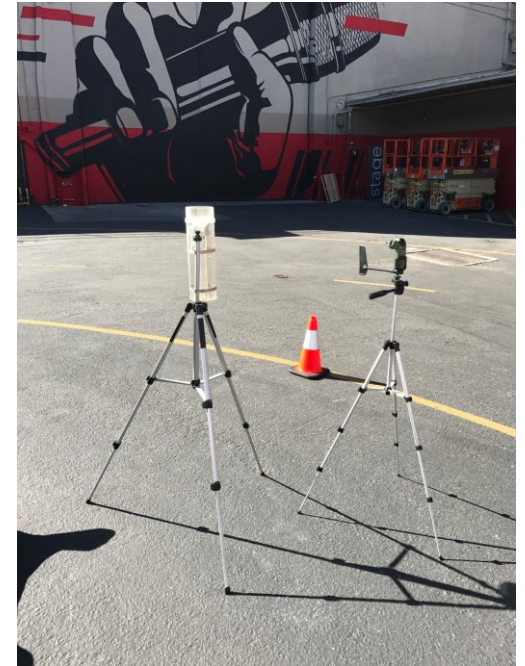
Observations being taken outside The Voice studios in Hollywood, CA

We prepare weather and climate reports and summaries for company brochures, employee training and orientation, and internal or external accident reports.