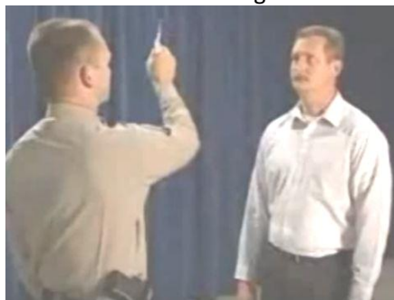
HGN (Horizontal Gaze Nystagmus) Demonstration