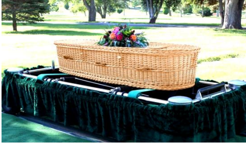
A "green" wicker casket

They suggest planting a tree to mark the grave which is not identified in any other way. Many funeral directors are available to assist with a green funeral. In addition to green funerals, many consumers are returning to the days of funerals being held in the home of the deceased. Again, funeral directors are able to assist in the planning of this ritual.