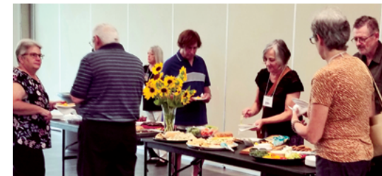
OPAL members enjoying the Fall 2022 Exhibition at the Westerville Recreation Center