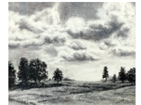
Left lane close I-76 #822 by Pertain Gillespie-Buckland