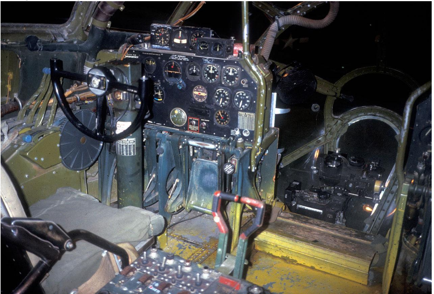
B-29 Right Seat looking at left seat controls