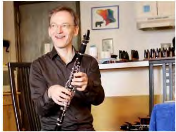
It hosts the 37th Avanti! Summer Sounds festival in Porvoo June 29-July 3, 2022.

While Toimii! reunited occasionally until 2003, Avanti! has earned its place in the Finnish musical establishment.