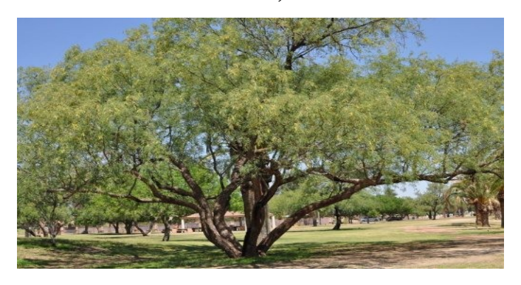
Reid Park Dog Training area

Reid Park Dog Training Area 22<sup>nd</sup> Street and Country Club Tucson, AZ