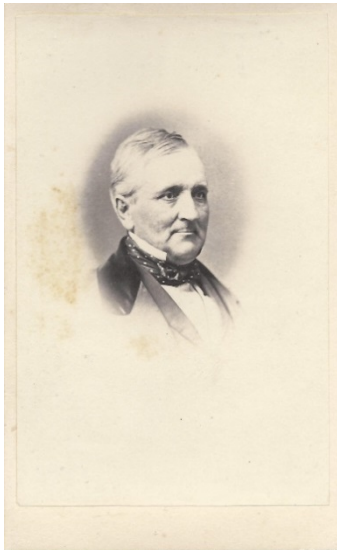
Henry Foote (1804-1880)

With Clay and Douglas off searching for a new California bill, rhetorical violence on the floor of the Senate gives way to physical violence.