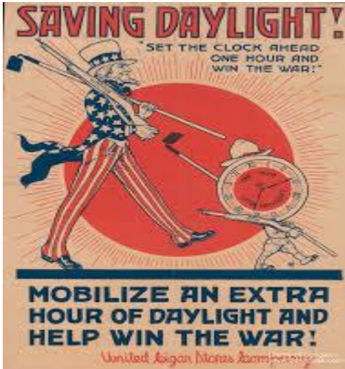
Starts March 10th