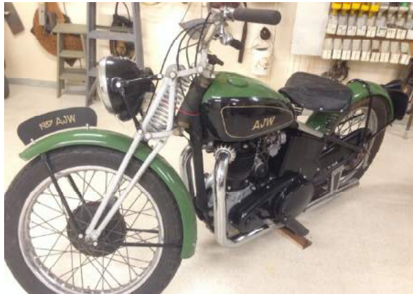
Terry's 1937 AJW