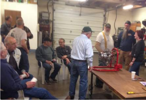
OTC members mingle with Modeling Club