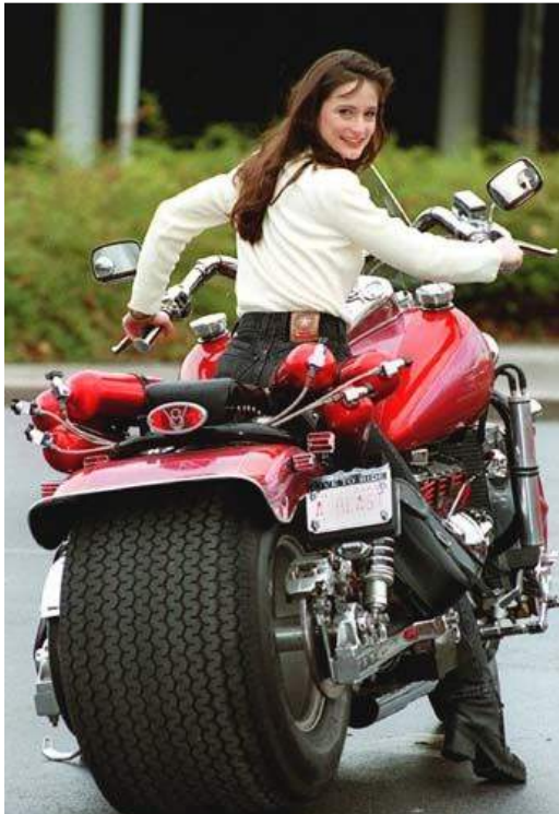
"Does this tire make my butt look big?"