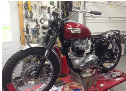
Tom R's 1969 Triumph TR6C