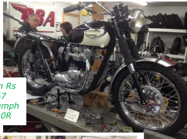
Tom R's 1967 Triumph T120R