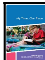
My Time, Our Place; Framework for School Age Care in Australia 2022 V2