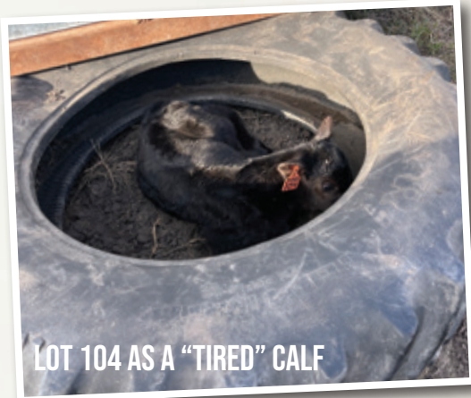
LOT 104 AS A "TIRED" CALF