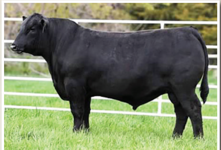
SAW Sonic Boom 865 – Sire of Lots 2, 15, 34, 48, 90, 115, 132, 371, and 409