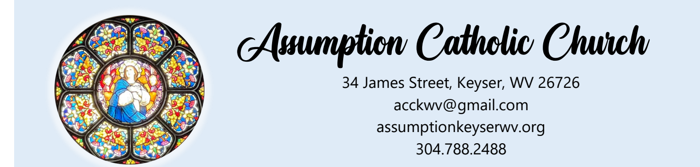
Fifth Sunday in Ordinary Time