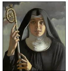
Feast Day: February 10

Sources: catholic.org and franciscanmedia.org