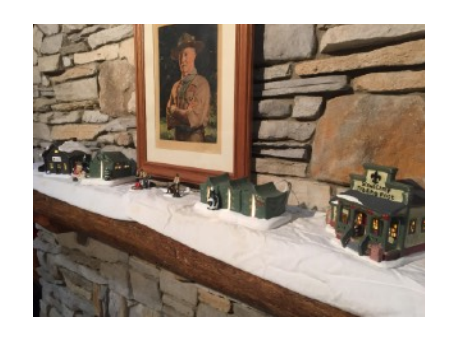
Click here for more information on the Holiday Party.