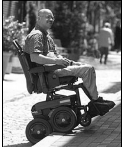
The iBOT and its user climbing steps