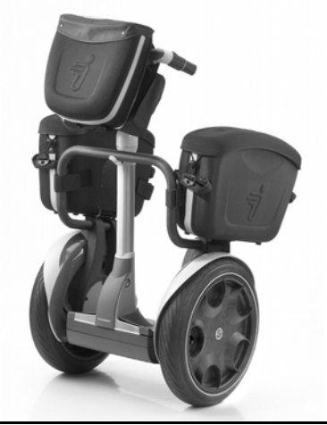
Segway HT, e series