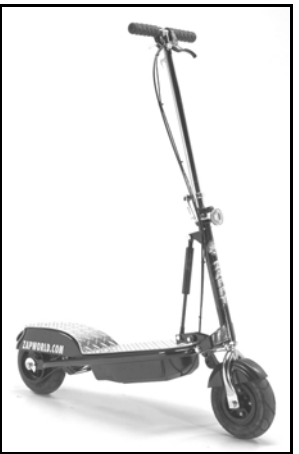
Zappy electric scooter

To start the scooter, all one has to do is push off energetically two or three times and activate the gas lever to engage the motor. It has a maximum speed of 20 km/h (may vary depending on several factors, such as rider's weight and evenness of terrain) and a maximum range up to 15 km.<sup>9</sup>