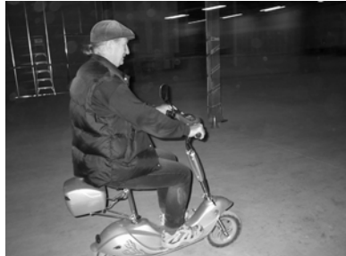
A participant on the Scorpion S-I

Compared with Segways, however, electric scooters seemed easier to learn how to use in terms of handling, reflex actions and getting around obstacles.