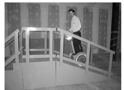
A participant going up a 20° hill

The survey results clearly show that the vast majority of users (80%) found all of the actions easy to perform. However, this percentage fell to 68% when it came to making turns (right or left) or going up or down hills. In the case of negotiating hills, the percentage of people who thought they felt fairly at ease increased from 17% to 28%. In all cases, the number of people who found these actions difficult to perform remained marginal, i.e., less than 5% of users. The action that seemed most difficult to perform was getting around obstacles. In this case, 40% of users said they felt moderately at ease, 55% felt completely safe and only 4% said they found it difficult (2 people out of 49).