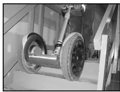
Negotiating stairs with the Segway