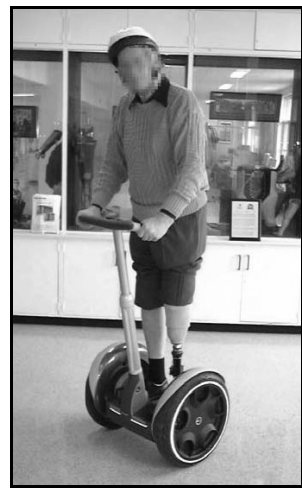
Amputee tests the Segway at Monash University

In June 2003, REHABTech, a centre specializing in rehabilitation (of persons with reduced mobility) affiliated with Monash University (Australia) conducted some basic tests of Segways involving an amputee and a person who had had polio who suffered acute fatigue. Within a short time, the patients were able to get on the Segways and use them confidently without a safety harness. The amputee commented: "I'll be confined to a wheelchair...If I use a Segway, I'll be more mobile for a longer time." The amputee took longer to get used to getting on and off the Segway: two to three minutes, compared with one minute for the polio survivor. The procedures consisted of watching the training video, followed by practical training with the help of the instructor, who held the crossbar while the patient stabilized the Segway. These operations were repeated until the patients were confident of having the device under control and not rocking to and fro. The most difficult operation was getting on and off the device. REHABTech believes the Segway HT, p Series, would be ideal and more practical for persons with reduced mobility because its platform is lower and easy to step onto.12 REHABTech also believes that the Segway should be an ideal solution for many people with reduced mobility. The Centre will release a document with instructions on certain aspects to consider in the use of Seqways by persons with reduced mobility.