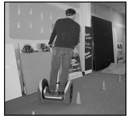
Practising turning with the Segway

With regard to safety, 70% of participants said that certified training in safety standards provided by the government would be desirable and 57% said that riders should wear helmets. Only 22% thought that a driver's licence was necessary, and a large majority (65%) thought there should be an age limit for Segway users, i.e., above age 14.