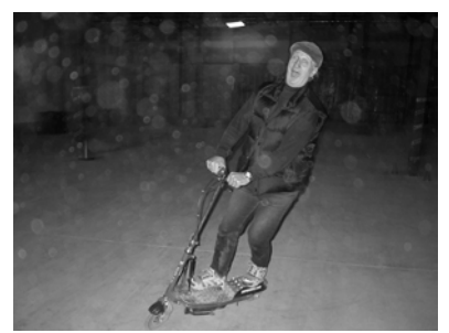
Practising turning with the electric scooter

The survey results clearly show that the vast majority of users (73%) found all of the electric scooter manoeuvres easy to perform. However, this percentage dropped to 53% when users carried out manoeuvres to get around obstacles, drive on various types of surfaces and pick up and set down objects. Between 20% and 30% of participants felt relatively at ease while carrying out these manoeuvres. In all cases, it was a marginal percentage of people who found these manoeuvres difficult, i.e., less than 5%. Manoeuvres to get around obstacles seemed to be the most difficult, with 30% of participants saying they felt relatively at ease, 52% saying they felt completely safe and 8% saying they found them difficult (3 out of 40).