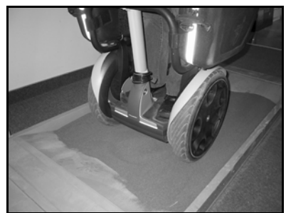
Close-up of Segway HT in the sandbox

devices might explain these variations from the previous data. Users required a certain period of time to feel fully confident on a motorized personal transportation device, be it a Segway, bicycle, moped or car.