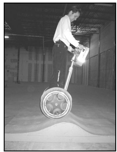
Riding over a hump

However, these problems diminished throughout the training and testing. Note also that in Table 5 comparable training was considered necessary for mopeds and bicycles, which require more training time than Segways. Cars require even more training because of their complexity. Moreover, a large majority of participants in the performance study thought that the amount of mental effort required to operate a Segway was low to average, which compares favourably with bicycles, mopeds and cars.