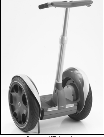
Segway HT, i series

Segways are activated by a coded key that is difficult to copy and records the user's settings. Each Segway has three "intelligent" keys that allow users to adjust their driving mode to their experience and riding conditions. Beginner mode (maximum speed of 8 km/h and slow turns) allows users to gain confidence and become familiar with the vehicle. Sidewalk mode (maximum speed of 12 km/h and average-speed turns) is tailored to pedestrian environments. Open Environment mode (maximum speed of 20 km/h and sharp turns) allows users to travel in open environments.<sup>6</sup>