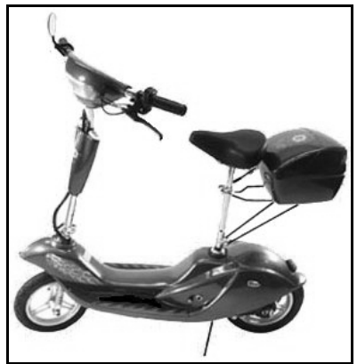
Scorpion S-I electric scooter