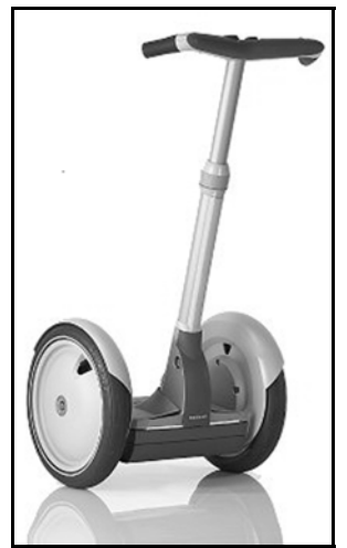
Segway HT, p series

The Segway maintains its own balance and that of its passenger. It is equipped with a stationary T-shaped control shaft fitted into a platform mounted on two parallel wheels. Segways are driven standing up and handle according to human body dynamics: lean forward to move forward, stand straight up to stop, and lean backward to reverse. The device has no brakes or accelerator, but has a handgrip for making turns. It is the only vehicle able to turn in place, just like a person, because its wheels have the ability to turn in opposite directions. Segway LLC recommends four hours of training on the Segway HT, e Series (commercial model) and 30 minutes of training on the Segway HT, i Series and p Series (consumer models). This theoretical and practical training teaches the basic fundamentals of riding a Segway HT.