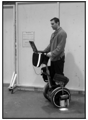
General test procedures

All of the tests were carried out by one rider who was tall and had used the device for about 20 hours prior to the tests. All of the tests were carried out in high-speed mode (red key) and only on a dry surface.