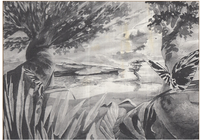
The glory of God is revealed in his creation, such as in this landscape. God's name is to be held in reverence.