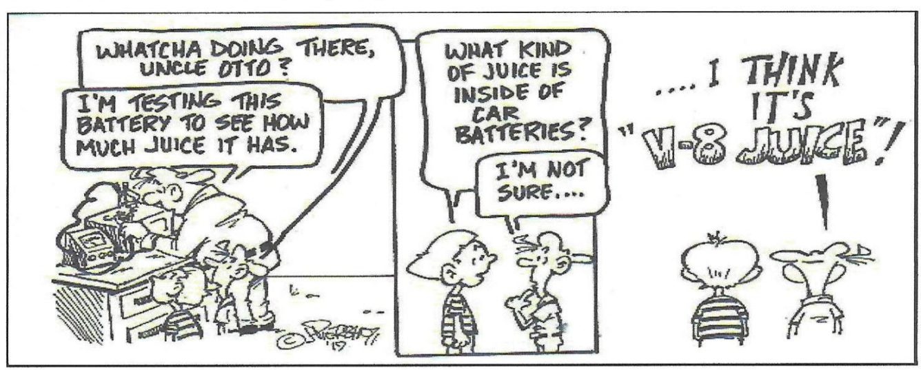
Reprinted from OLD CARS WEEKLY