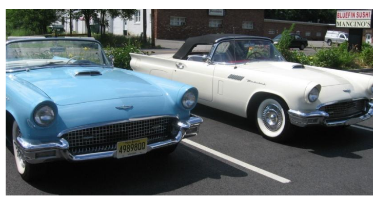
Life isn't about arriving at the end in a pristine, well preserved body, it's about sliding in sideways, all clapped out, yelling "What a ride!!"