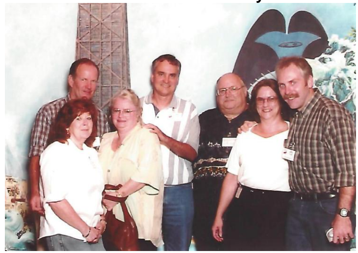
A picture from yesteryear

2nd-Int'l Beer Day 3rd - National Watermelon Day 10-National S'mores day 4th-U.S. Coast Guard Day (one for you Steve) 21 Senior Citizen's Day