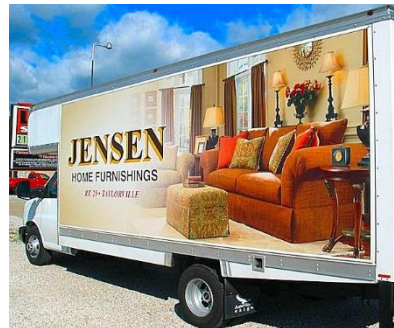
TS23 - For box trucks and trailers the TS23 is the right choice.