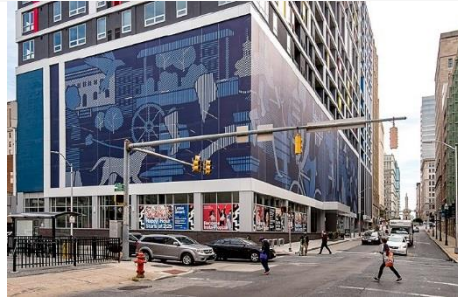
TS44 - Here this 17,000 Sq. ft. facade banner is covering a five-floor parking.