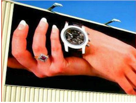
TS32 - Here is a frame mounted on a metallic corrugated wall.