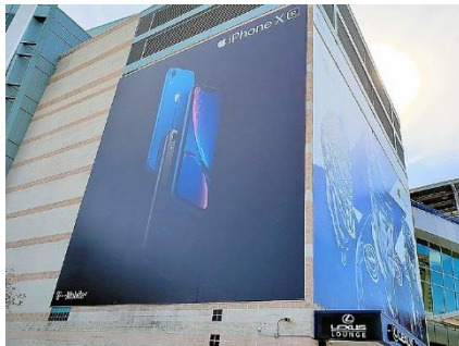
TS23 - large banners on concrete wall (Here 65' x 48')

2- If the wall is not smooth (Disjointed bricks, stones, corrugated, irregular stucco,...) the choice is between the TS32 and the TS44. The TS44 will be chosen whenever there are large gaps in the walls (Windows, opening between floors...) or the size of the frame is very large.