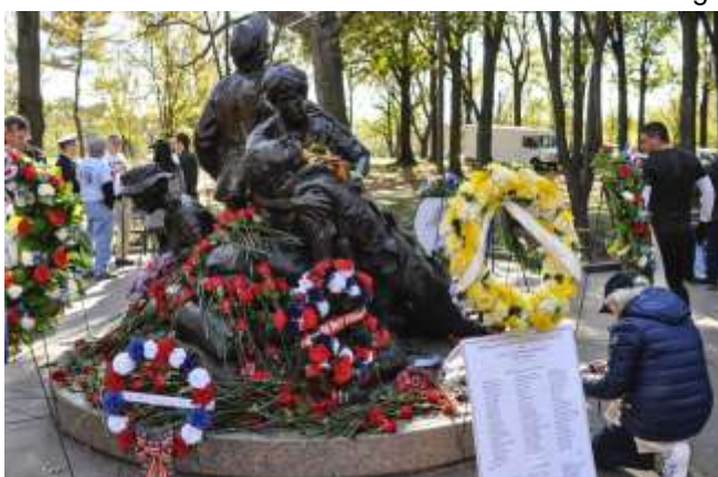
Visitors covered the Vietnam Women's Memorial in flowers for Veterans Day on Sunday, Nov. 11, 2018. The memorial, which sits near the Vietnam Veterans Memorial on the National Mall, was dedicated 25 years ago, on Nov. 11, 1993.