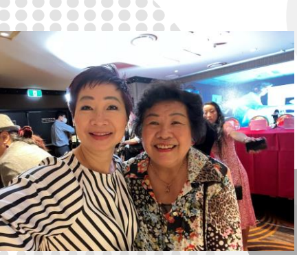
Alice In Wendyland Charity Media Launch