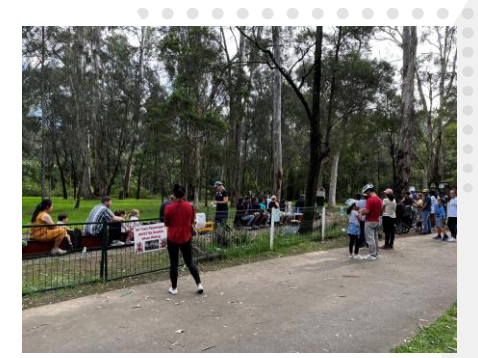
Nurragingy Reserve – picnic Miniature train ri<mark>de fami</mark>ly fun day