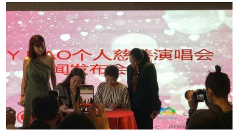
Alice In Wendyland Charity Media Launch