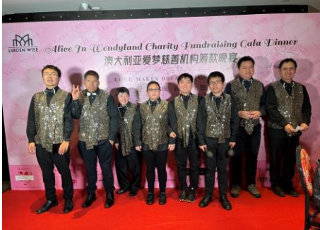
Alice In Wendyland Charity fundraising performance