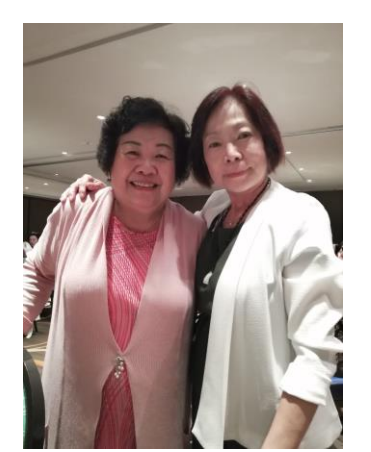
WayIn Network 30<sup>th</sup> Anniversary Media Launch