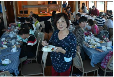
Mother's Day Celebration Cruise Lunch @ Georges River