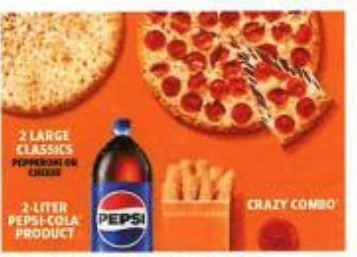
CLASSIC MEAL DEAL CODE 2 Classic pizzas (Pepperoni or Cheese), one Crazy Combo' and a 2-liter PEPSI-COLA' product