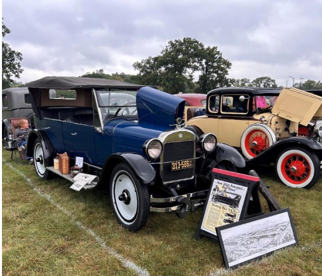
This 1924 REO was nicely displayed with period accessories and tools. It picked up a Best of Class trophy.