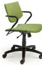
1662 A : 19 1/2" C : 16 - 21" E : 13"