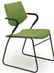
1642 A : 17 1/2" C : 18" E : 12 1/2"