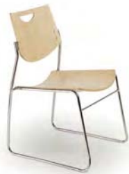
1640 A : 17 1/2" C : 18" E : 12 1/2"