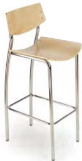
1680 A : 17" C : 30" E : 7 1/2"