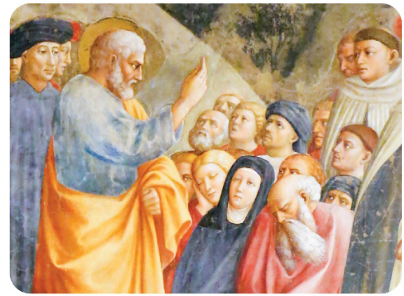
ST. PETER PREACHING, BY MASOLINO