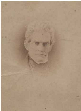
John C. Calhoun (1782-1850)

In response to the devastating threat inherent in the Wilmot Proviso, they are left with a Northerner, Lewis Cass, heading the ticket, and “popular sovereignty” as their best hope for expanding slavery into the west.