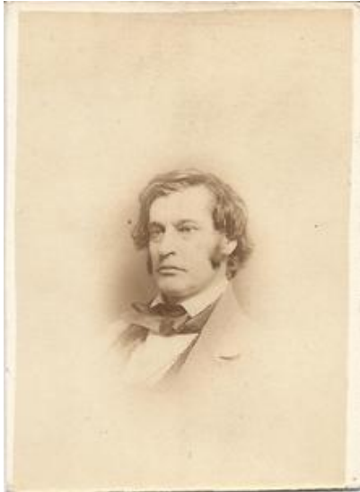
Charles Sumner (1811-1874)

On the Whig side, the nomination on June 7 of another Southern slave-holder, Zachary Taylor, is beyond the pale for many delegates, most notably a contingent from Massachusetts who will go on to play key roles in the emancipation movement.