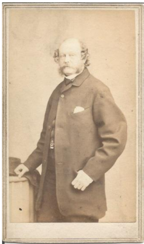
Martin Van Buren (1782-1862)

Other Democrats dissatisfied with the Cass-Butler ticket are the “Barnburners,” ready to bring down the party structure to have their own way.