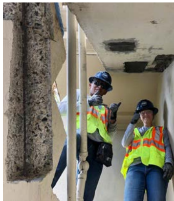
In Progress: column and soffit repairs