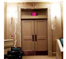
Before (top): cracks at door surround; After (bottom)