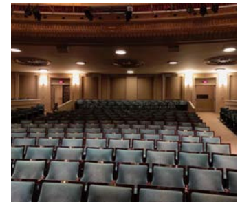
Repaired door surrounds at back of theater