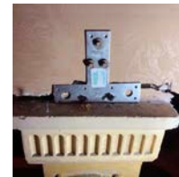
Before (top): structural crack; In progress (bottom): building up repair material to match profile