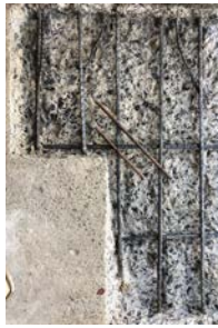
Partial depth slab repair: concrete removal; reinforcing hand placed placement