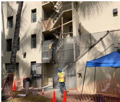
In Progress: work at exterior of building with CPI team and public safety barriers in place