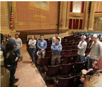
CPI active duty military team discussing project with clients