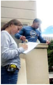
Assessing conditions, planning repairs