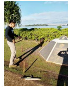
Prep for next CPI project, US Marine Memorial, Pearl Harbor Visitor Center