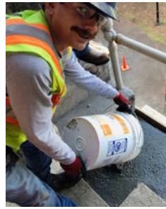
Partial depth slab repair concrete hand placed