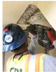
Deteriorated concrete removal at soffit