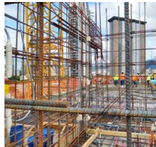
Team field trip to learn about high-rise building construction