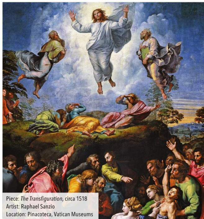
Piece: The Transfiguration , circa 1518

Here is where we need the power of God's mercy and love. Peter wanted to stay in Christ's presence and enjoy it, soak it up, remain, and never go down the mountain again. He heard the Father's voice, knew he should listen to the Son, and was resolved to do so! Although