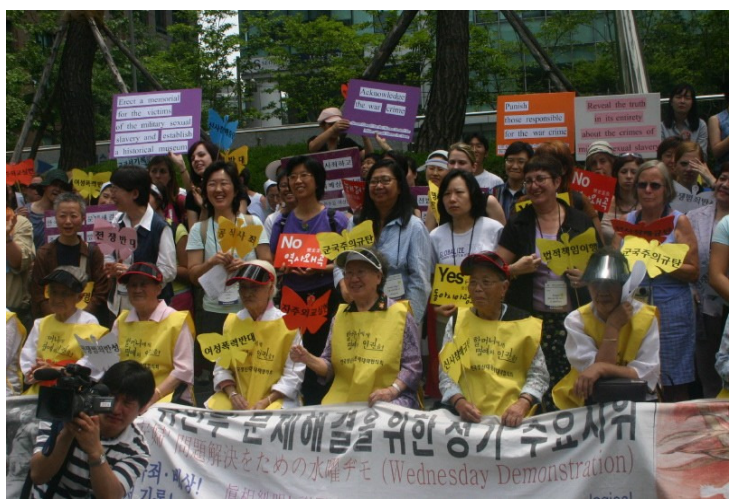
A protest by former comfort women

This is not the first such bill introduced in the House, including previous efforts on behalf of American POWs. None have been successful. Importantly, however, this time the bill has bipartisan sponsorship from its inception. Perhaps even more importantly, there are some subtle—yet powerful—changes in the language used in this attempt: with an eye to the fact that the San Francisco Treaty protected Japan from demands for compensation from victim nations, a position supported by the US State Department ever since, the compensation question has been put aside in favor of more strategically deployed terminology.