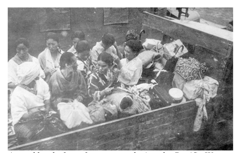
A truckload of comfort women during the Pacific War