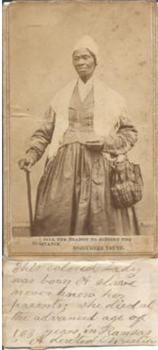
Sojourner Truth (1797c-1873)

Then, of course, there is Frederick Douglass, who will go on to lead the black citizenship movement over the next three decades. In 1840, he is twenty-two years old and living in Bedford, Massachusetts with his wife, after escaping from his Maryland master. He has already become a licensed preacher and avid reader of the Liberator , but is yet to achieve the prominence that will follow his landmark August 1841 address to the Massachusetts Anti-Slavery Society on Nantucket Island.