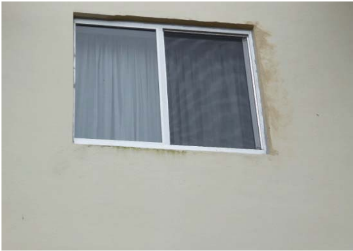
#9 OPENING PROTECTION WINDOWS ARE NOT PROTECTED