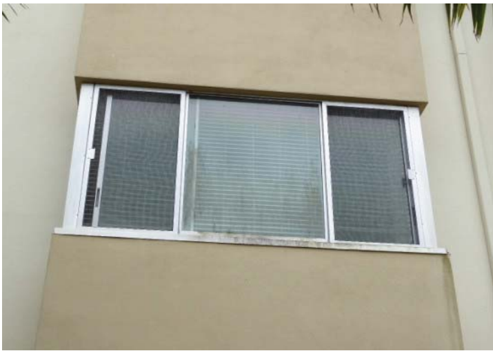
#9 OPENING PROTECTION WINDOWS ARE NOT PROTECTED