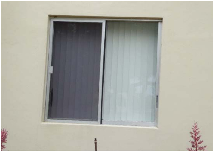
#9 OPENING PROTECTION WINDOWS ARE NOT PROTECTED