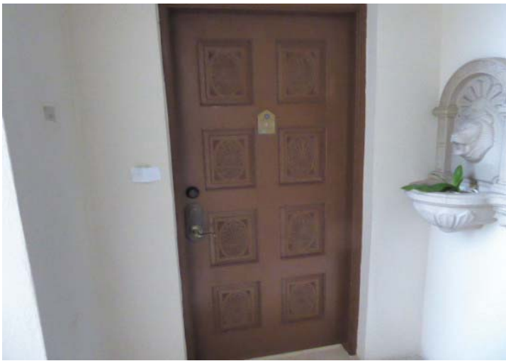
#9 OPENING PROTECTION DOORS NOT TO CODE