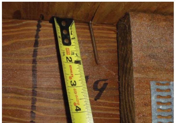
#3 ROOF DECK ATTACHMENT 8d NAILS