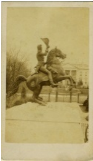
General Jackson Rides In

By 1824, the field has expanded to five contenders.