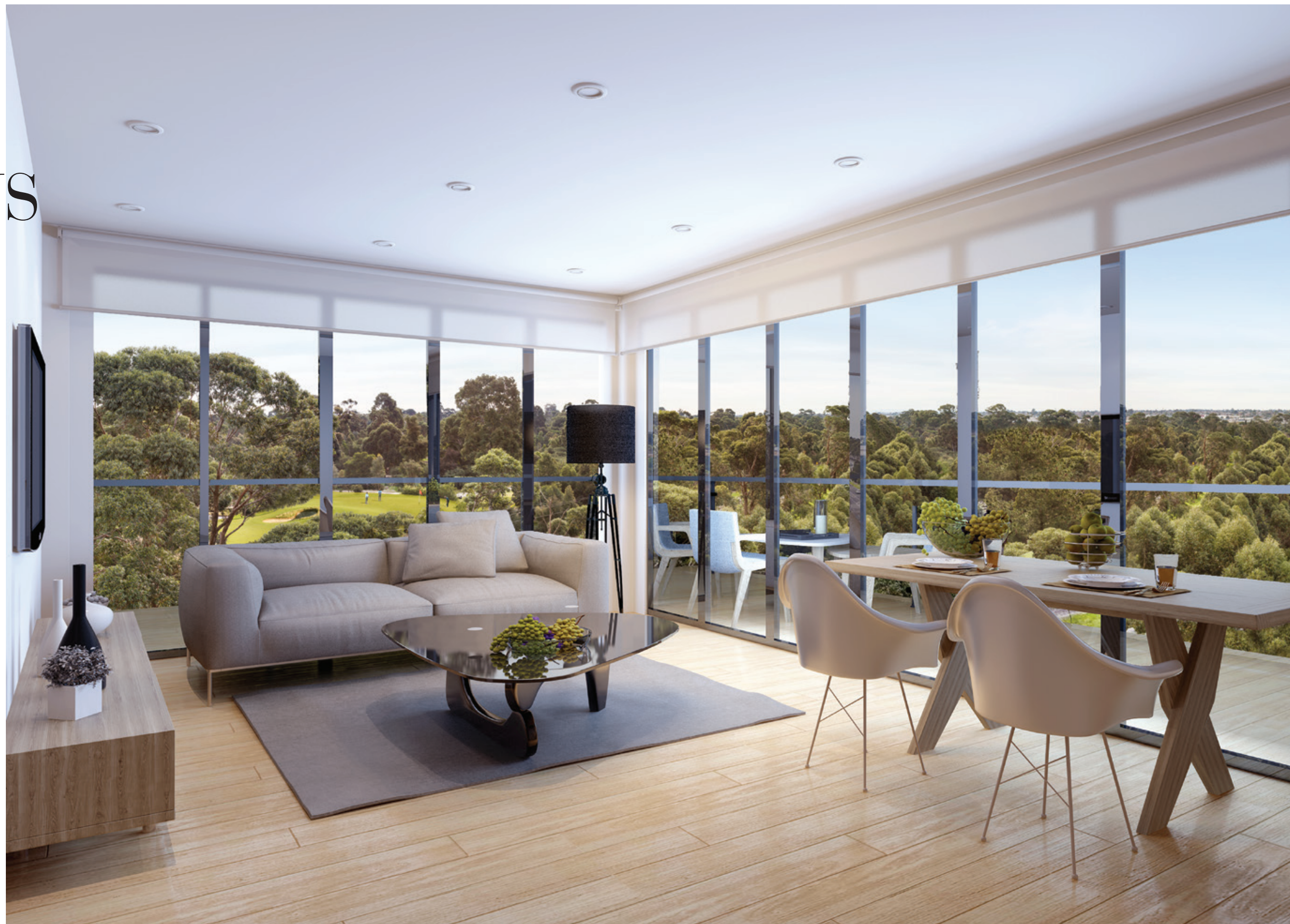
Artist Impression \ Living