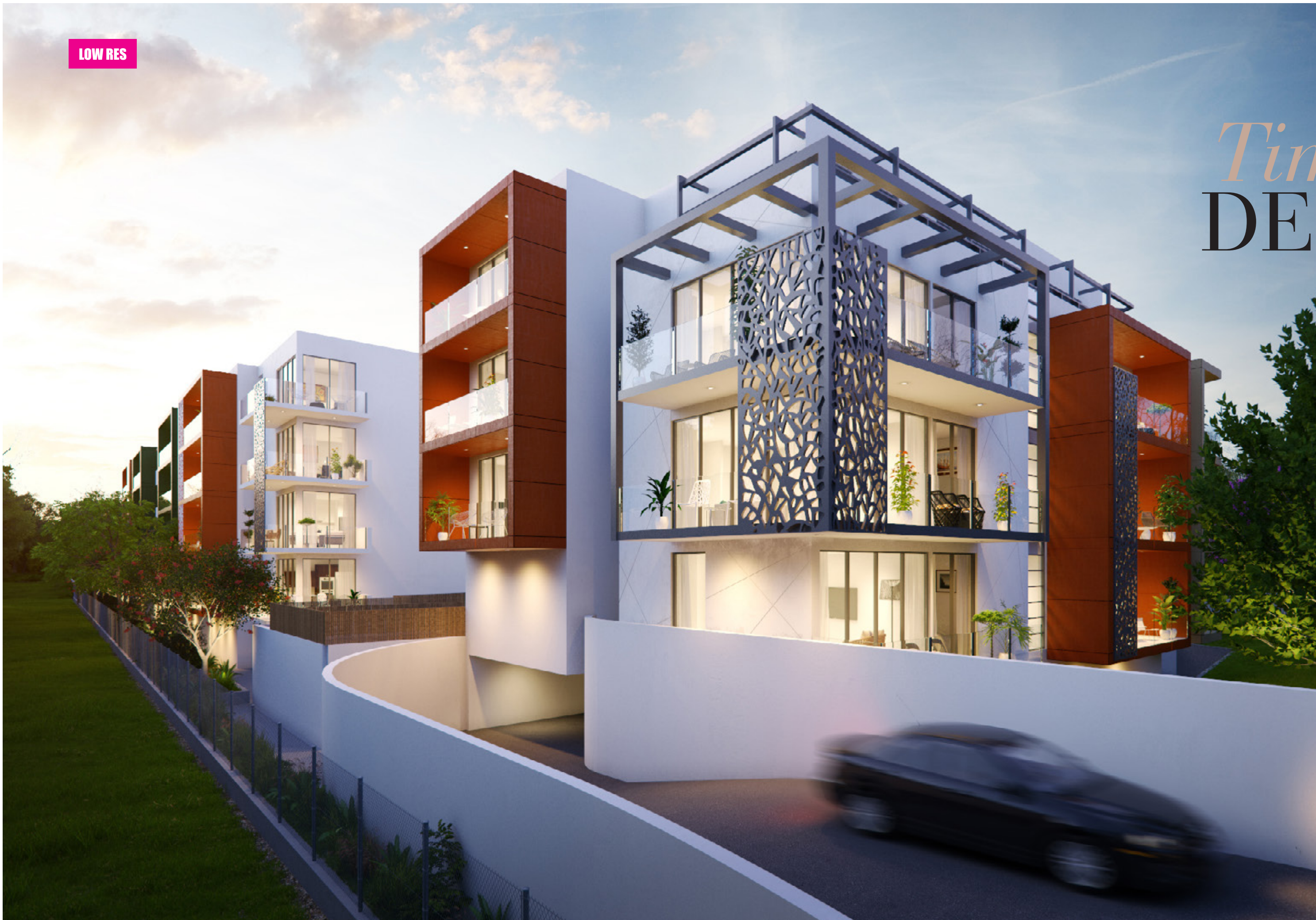
Artist Impression\ Exterior Centre Road