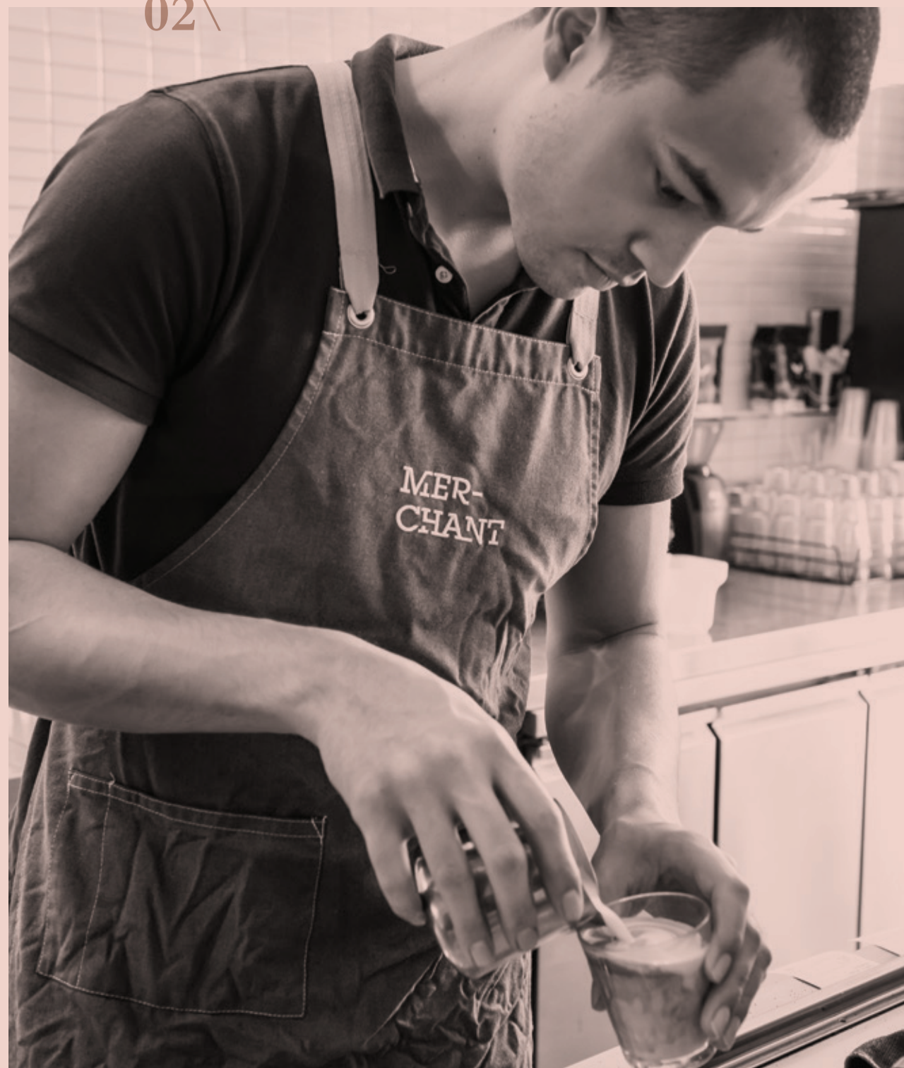
02\ Merchants Guild