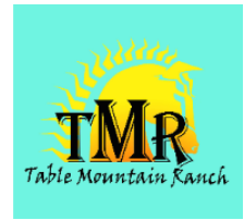
Table Mountain Ranch 19000 W 58th Ave Golden Co 80403