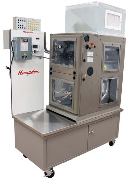
Model H-GHT-4 Gas Fired Warm Air Heating Trainer Dimensions: 79-3/8"H x 62"W x 28"D Shipping Weight: 600 lbs.