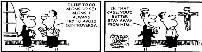
PRESENTATION OF THE LORD