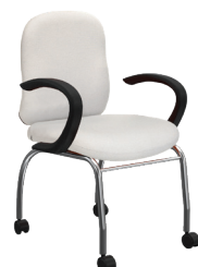
FX-L-4 A : 19" C : 18" E : 16"