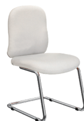
FX-L-2 A : 19" C : 18" E : 16"