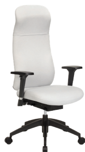
FX-E A : 19" C : 17" - 22" E : 31"