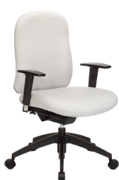
FX-H A : 19" C : 17" - 22" E : 21"