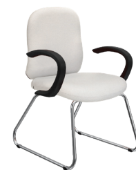
FX-L-3 A : 19" C : 18" E : 16"