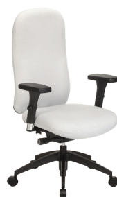
FX-D A : 19" C : 17" - 22" E : 27"