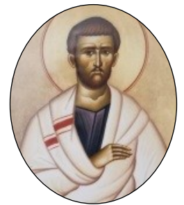
Feast Day: June 1