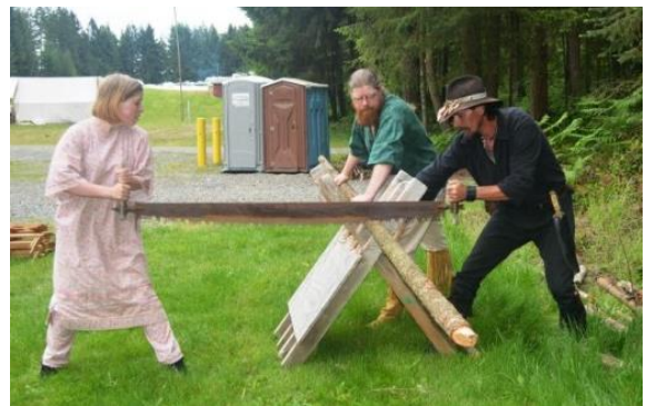
Teamwork with the cross cut saw

These three also thought it would be good to have a non-shooting competition, and put together the Buck and Doe event. This