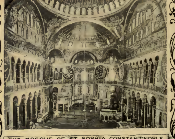
THE MOSQVE OF ST. SOPHIA, CONSTANTINOPLE