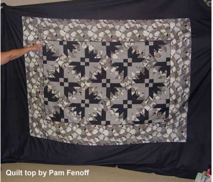
Quilt top by Pam Fenoff