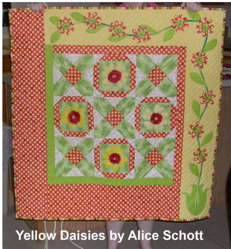
Yellow Daisies by Alice Schott