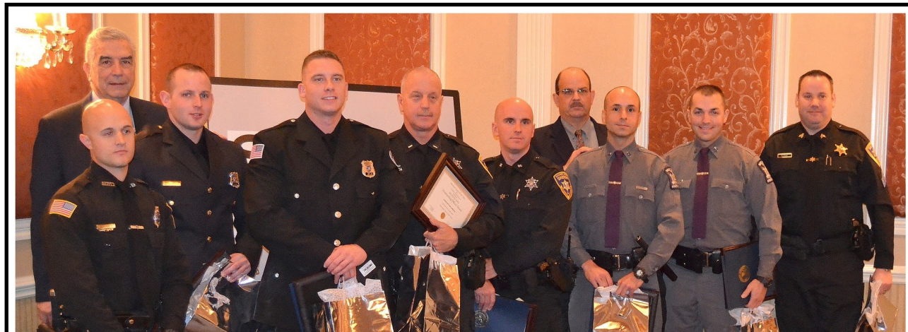
Members of the Dutchess County STOP-DWI Program honored local "TOP COPS" on Thursday for their commitment to the program's mission of keeping residents as safe as possible on the roads.

To report a street light out please contact the Village Clerk and go to the following website: