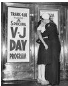
V-J Day -Sept 5, 1945 End of WWII