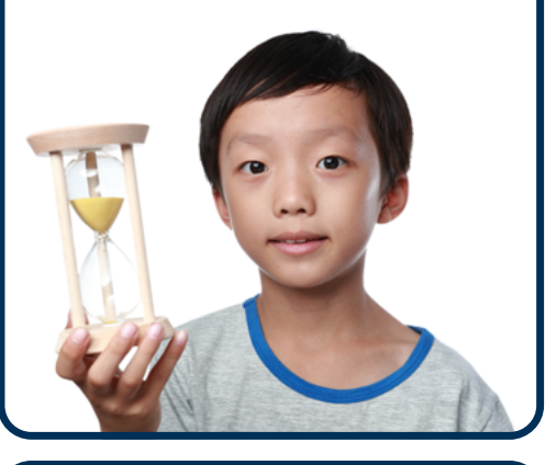
Say, "Please, stop."