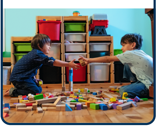
Ask for help