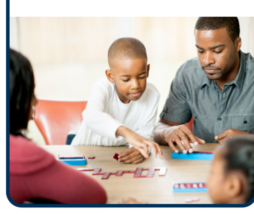
Say, "Will you play with me?"