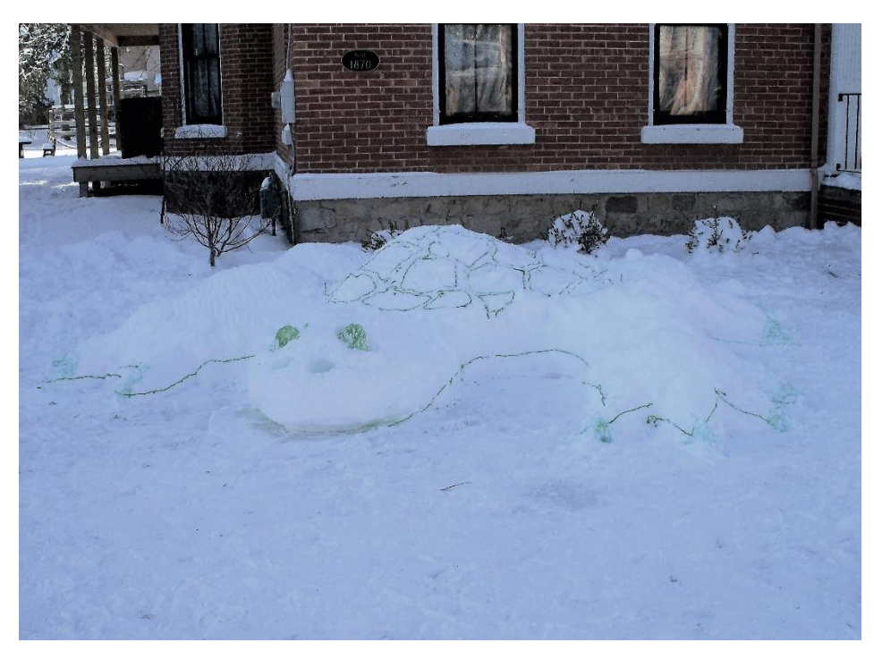
2<sup>nd</sup> Place Residential: 242 Edgett Street